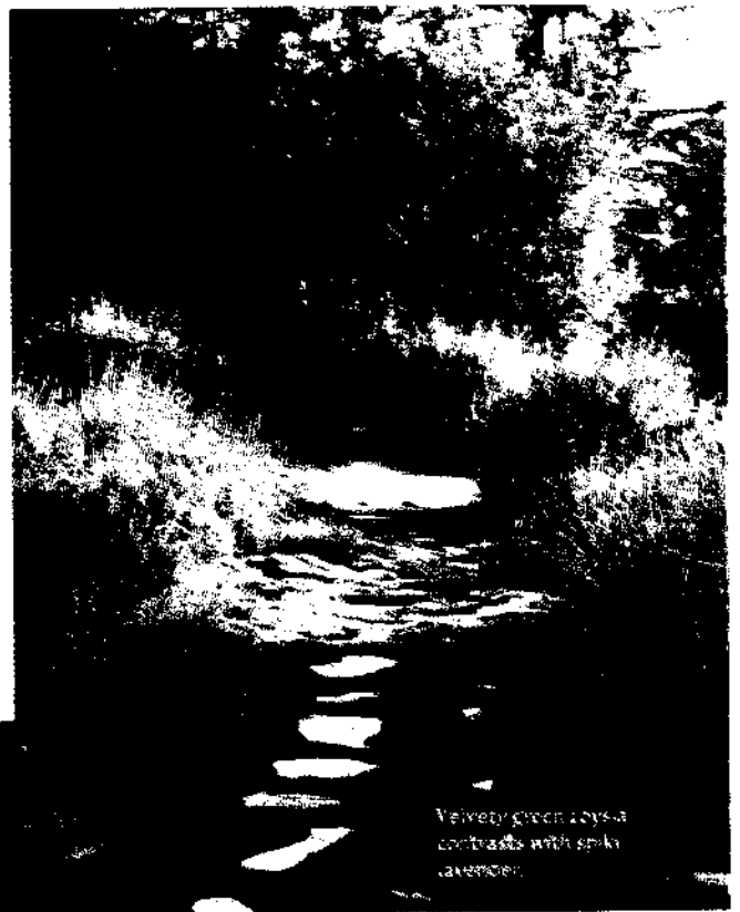
Velvety green zoysia contrasts with spiky lavender.

grasses, salvias—any plant with a billowy habit—would create the same effect. CHANGE HARDSCAPE TO SUIT THE MOOD As it approaches a grove of oaks, the path changes from grass and pavers to more casual decomposed granite, suggesting a move from city to country. Switching the palette of plants along the path, to 'Little Ollie' olives, heightens the sensation.