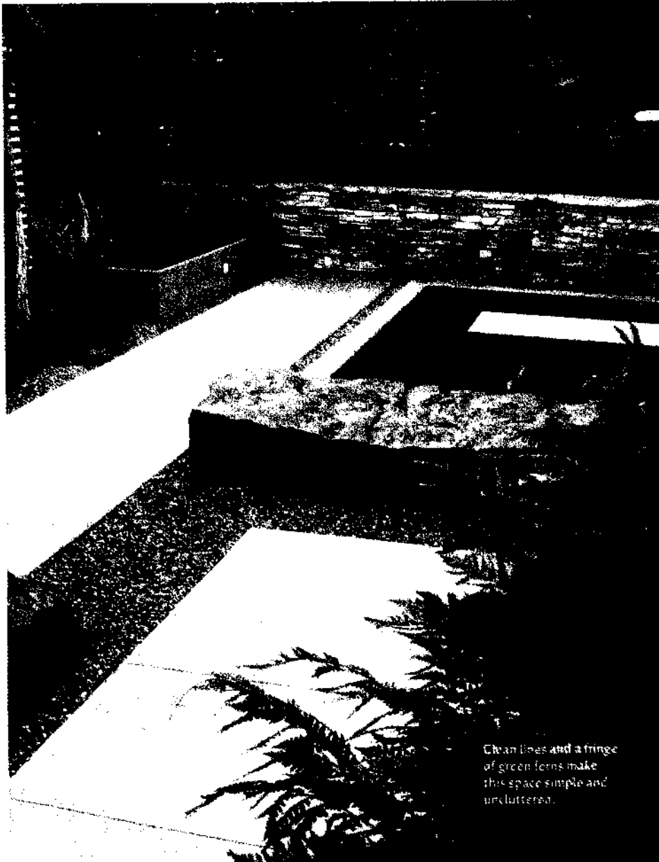
Clean lines and a fringe of green ferns make this space simple and uncluttered.